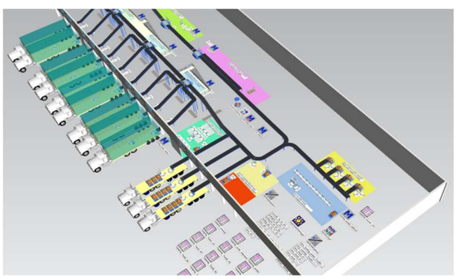
Figure 5 Simulation model on which experiments were carried out