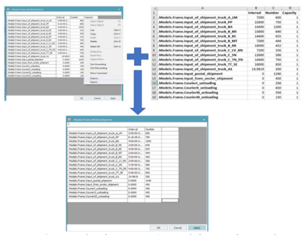
Figure 4 Example of Import MS Excel data to the simulation model

Štefan Mozol; Patrik Grznár; Martin Krajčovič