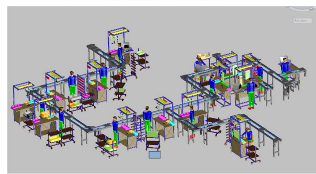
Figure 4 Examples of a draft concept for workplace work standing up and a seated position

Workstation accessories - these functional workstation components can be used at any station and increase the efficiency of workers. They offer defined storage spaces, support work processes, and ensure optimum transparency and ergonomics. All workstations can be equipped with side panels and footrests, as well as cloth and bottle holders. It is possible equip the workstations with socket strips, system lamps, and compressed air strips. Suitable accessories make it possible to supply grab containers, tools, and information at the workstation. An accessory upright permits, for example, installation of material shelves for parts supply at the workstation.