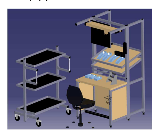
Figure 3 Example of modular workstation and mobile stock rack

Custom designed workstations offer a wide range of variable dimensions and individual solutions or select from standard products with fixed dimensions. At fig. 3 is example of image manual assembly worktable with accessory equipment.